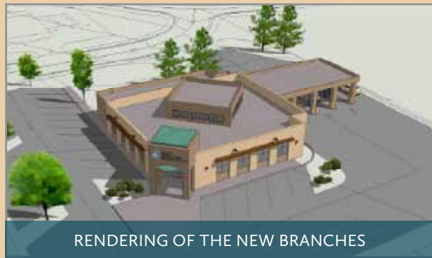
RENDERING OF THE NEW BRANCHES